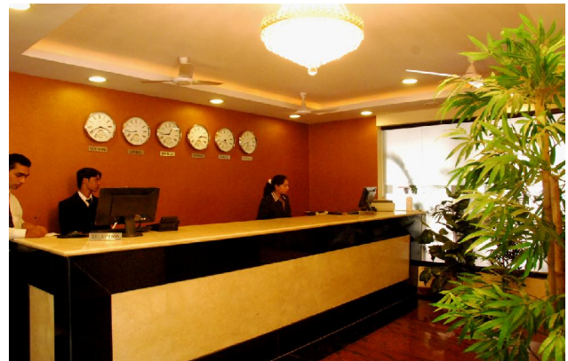
Hotel Front Desk