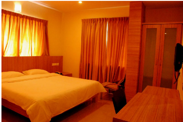
Suit for three people