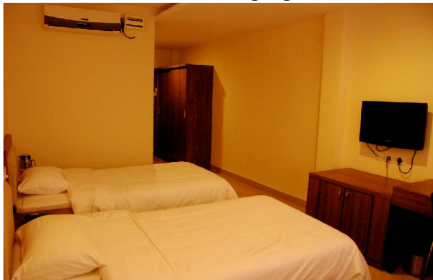
Suit for three people