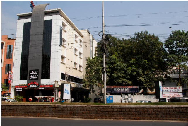
Hotel CITITEL Elevation

NOTE: Tariff for ICSCI-2010 conference delegates: Rs 425/- per day (24 Hours) inclusive of all taxes. This includes complimentary bed coffee and breakfast (buffet). Three people will be accommodated in a suite. Book your accommodation by contacting Mr. Muneer of the hotel. This tariff has been approved by the hotel management on request from Pentagram Research Centre (P) Limited, Hyderabad as a special offer especially for the conference delegates.